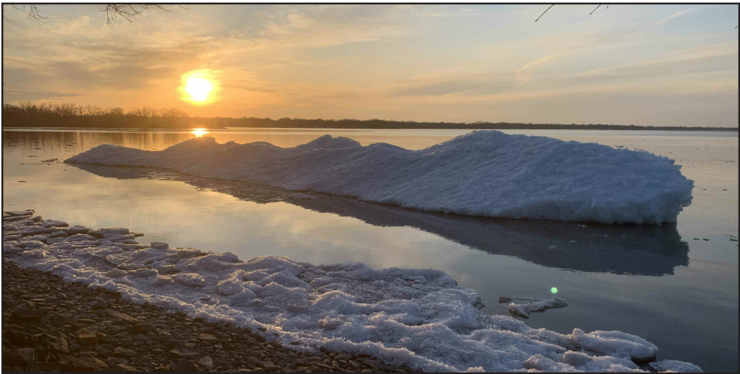
A Winnebago iceberg during ice-out in spring 2021. Because of this year's mild winter, Lake Winnebago did not freeze over until January 10.

During their days of retreat, the novices and seminarians were not only entering more deeply into the Advent season and its preparation for Christmas, but also nurturing their vocations. As Pope Francis reminds us, "Vocations are born in prayer, and only in prayer can they persevere and bear fruit."